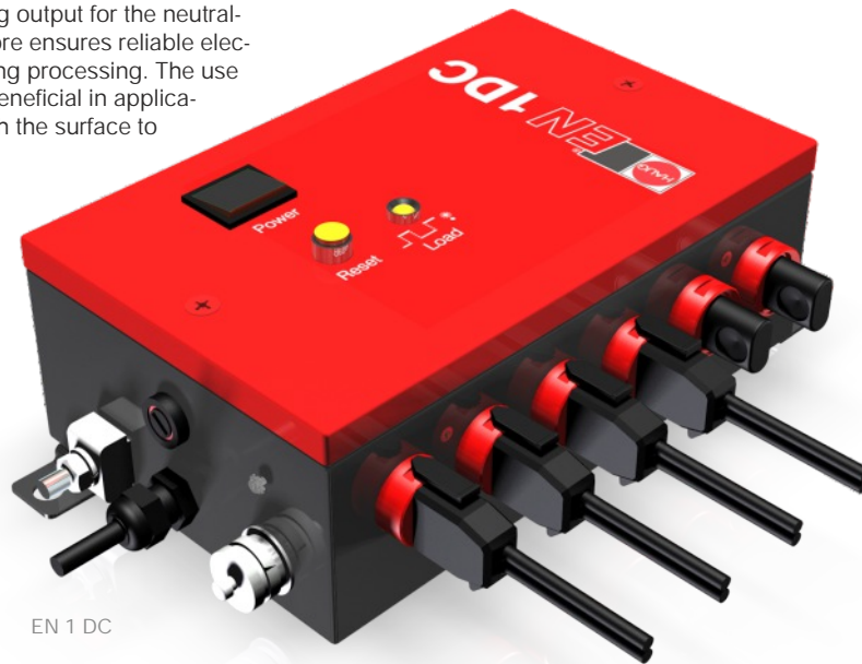
EN 1 DC

In combination with the connected direct voltage ionizing units, the EN 1 DC provides a high discharging output for the neutralization of electrostatic charges. It therefore ensures reliable electrostatic neutralization even in fast running processing. The use of the "DC Line" product family is also beneficial in applications where it is not possible to approach the surface to be discharged down to 30 mm.